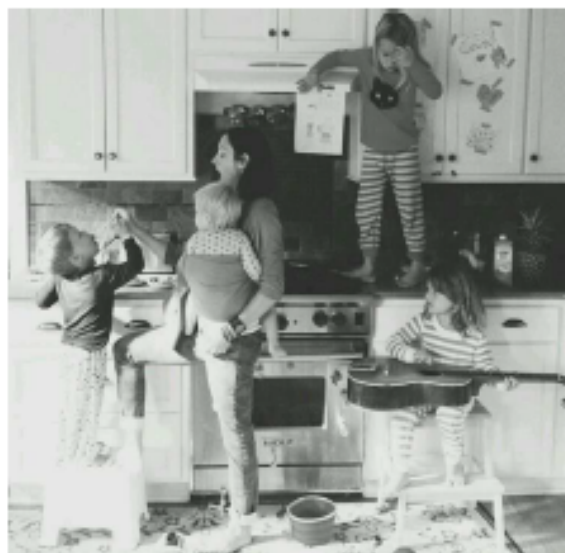
PHOTO EXHIBITION WHIMSICAL MORNINGS - HANGING BY A THREAD

GETTING READY FOR THE DAY IS SOMETHING WE ALL HAVE TO DO. DOING THIS WITH CHILDREN IN TOW CAN BE A CHALLENGING AND WHIMISCAL TIME. THE EXHIBITION AIMS TO HAVE PARENTS AND CARERS RECOGNISE THAT WE ALL HAVE THE SAME CHALLENGES IN THE MORNING. THAT WE ARE NOT ALONE.